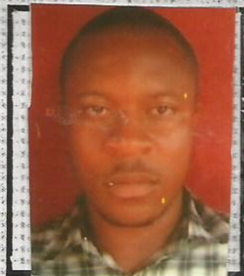
Photograph of Holder of Certificate

This Certificate of Proficiency is subject to endorsements as to any additional requirement in accordance with the above Regulations.